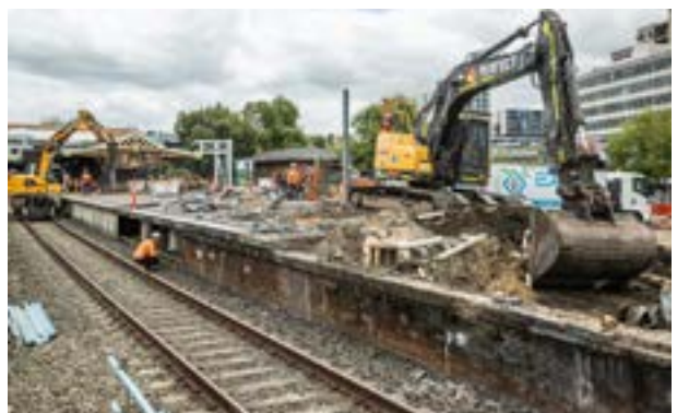
At Bankstown we are creating a new central plaza between the Metro and Sydney Trains stations