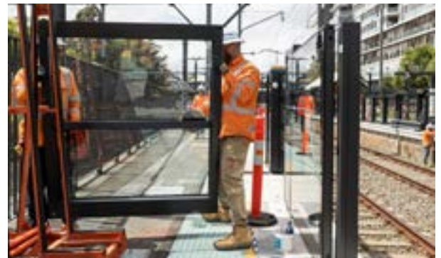
New platform screen doors are a key feature of Sydney Metro stations